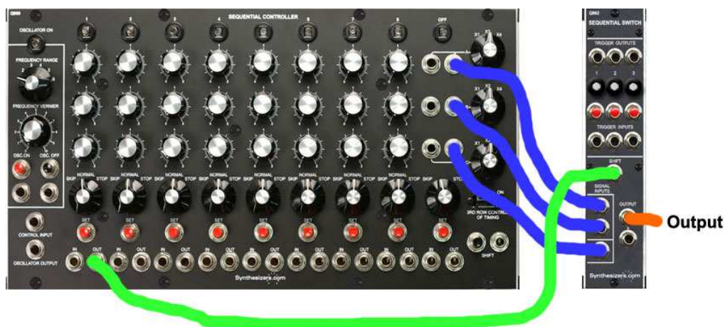
Typical 24-Stage Patch